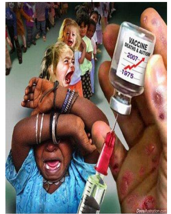
Ingredients: Mercury, Formaldehyde, Aluminum Phosphate, Agarose, Normal-Fetal Tissue, Monkey Kidney Lung Cells, HSA, Bone-Tissue-Derived

Visit our website at: www.blueribbonchiro.com or call us at 404-444-4519.