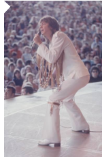
David Cassidy in concert.